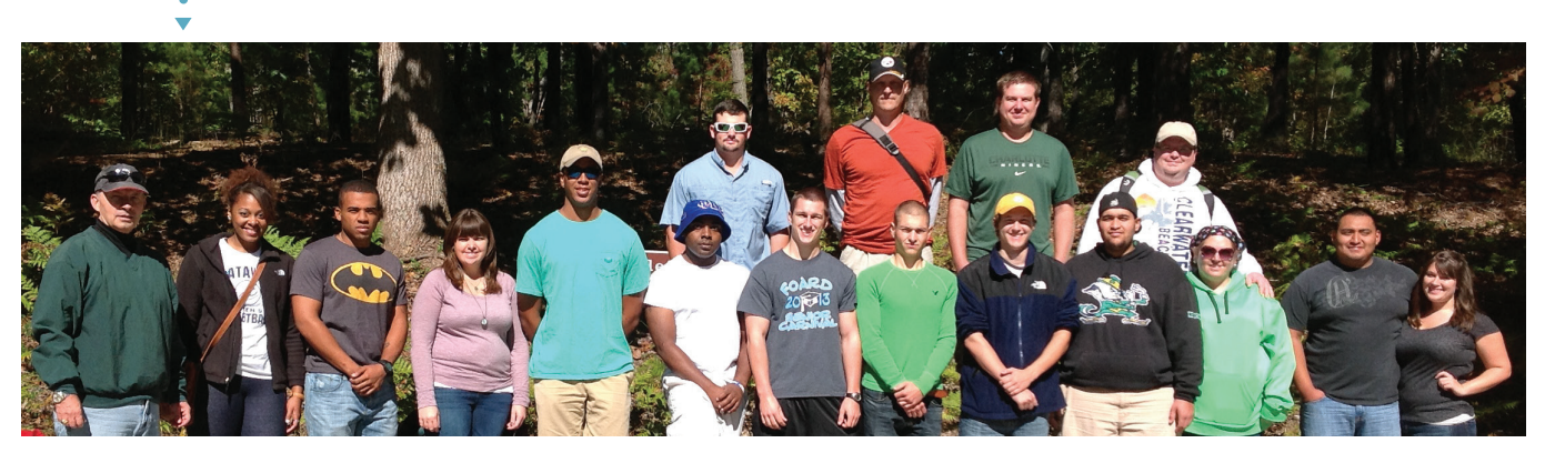
Annual Kings Mountain Battlefield National Park Field Trip (2007)

Southern Historical Association-sponsored tour of Reconstruction sites portrayed in his book, Uncivil War: Five Street Battles in New Orleans and the Rise & Fall of Radical Reconstruction, in New Orleans, Louisiana (2008).