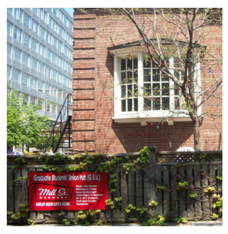
The Graduate Student Union pub on the University of Toronto campus.