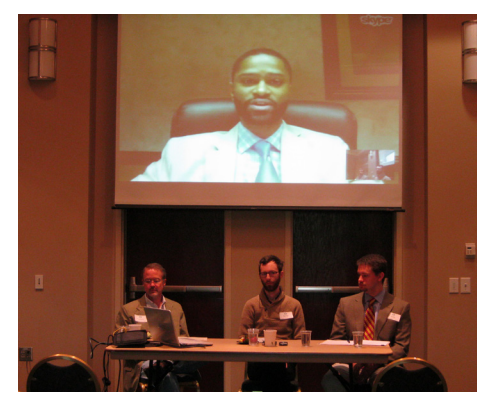
Skype Round-Table Panel Discussion